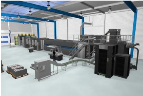
Photograph One: A Sinapse Training Simulator is offered as an option with the Goss International M-600™

Publication images like these are available from Sinapse: