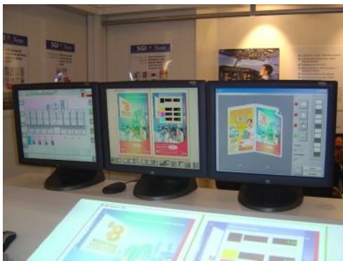
Photograph Two: Sinapse Training Simulators are now available on a wide range of web fed, sheetfed and flexo presses. This image shows a typical Sinapse simulator demonstration at an international exhibition.